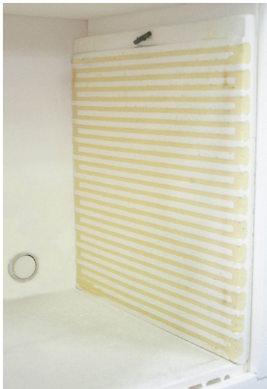
Wall mounted elements for easy access with no insulation removal required for replacement.