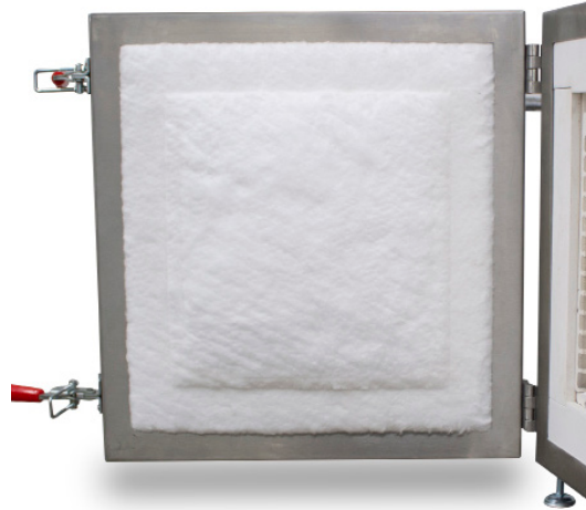
Blanket filled door for a positive seal that allows for easy customer replacement.