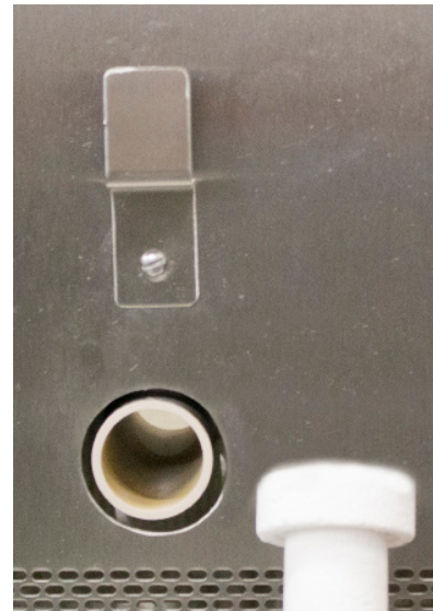
Ceramic tube port for thermocouples during temperature survey. When not in use, an insulating plug is supplied.